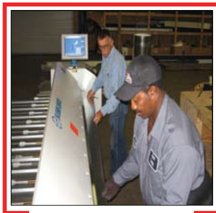
CUSTOM SHEET METAL